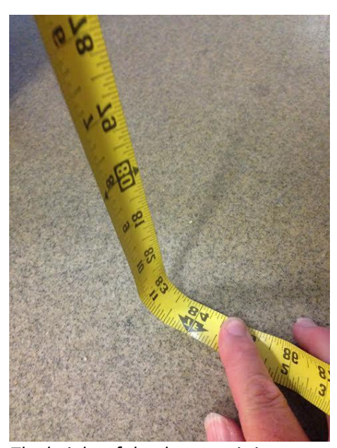
The height of the doorway is just over 83 inches.