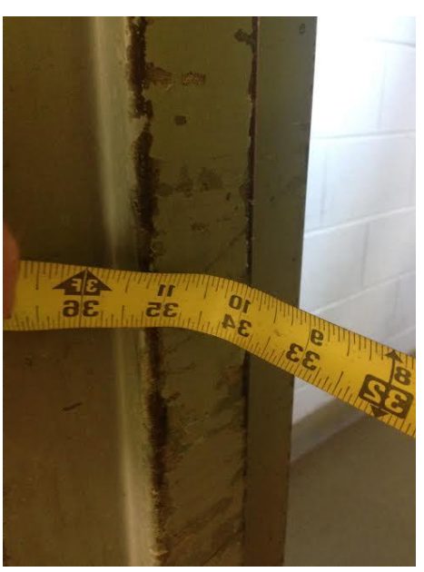
The width of the doorway is no greater than 33 inches when the door is fully opened.