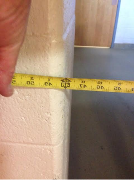
The witch of this entry way is no greater than 48 inches as shown above.