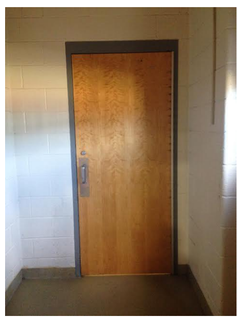
The doorway visible in the photo above, as you pass through the entry way, is a smaller passage than the first entry way. Plan accordingly.