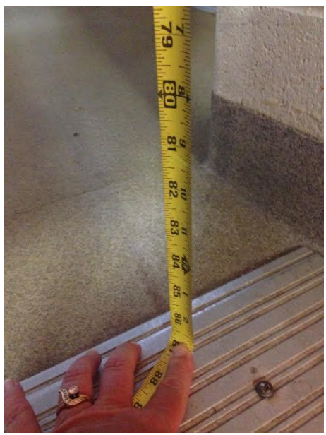
The height of this entry way is over 86 inches as shown above.