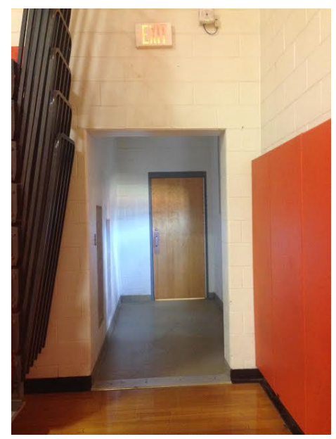
As you conclude your performance, you will exit the back right corner of the gym, which leads you through this entry way.

For unit planning, please see the EXIT DOOR/PATH details below: